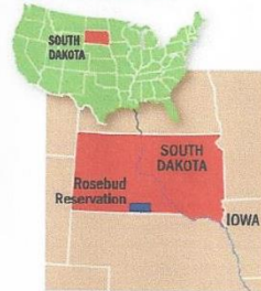
The Rosebud Reservation in South Dakota